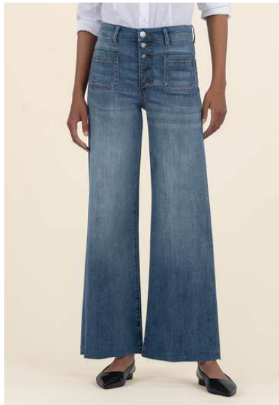
Wide leg ✨